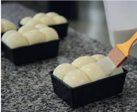
Brush or spray bottle.