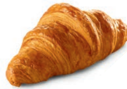
Croissants and puff-pastry