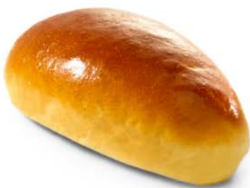
Sunset Glaze Pure

✓ Dilution is possible according to your requirements