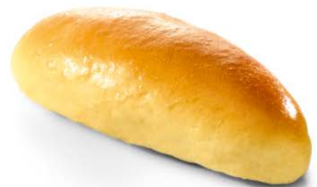
Sunset Glaze + 30% water