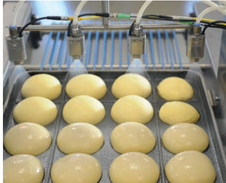
Spraying machine with multiple nozzles