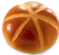
Brioche and buns