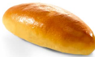
Sunset Glaze + 10% water