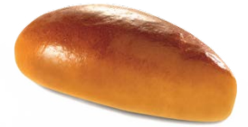
Soft bread and sandwiches